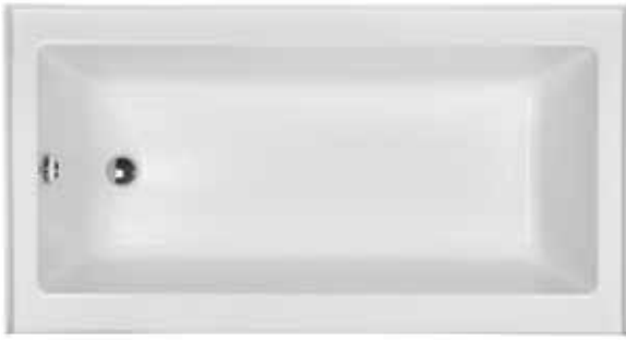
Features integral front skirting & tile flange on 3 sides.