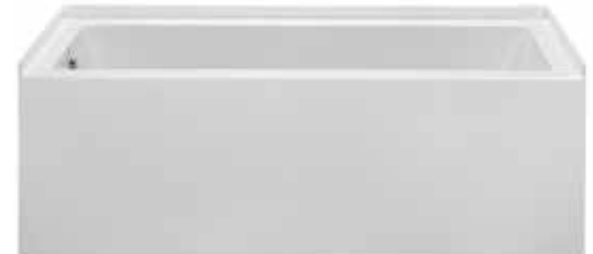
Front view of tub with non-removable front panel