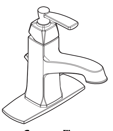
Conway™ Single-Handle Lavatory Faucet